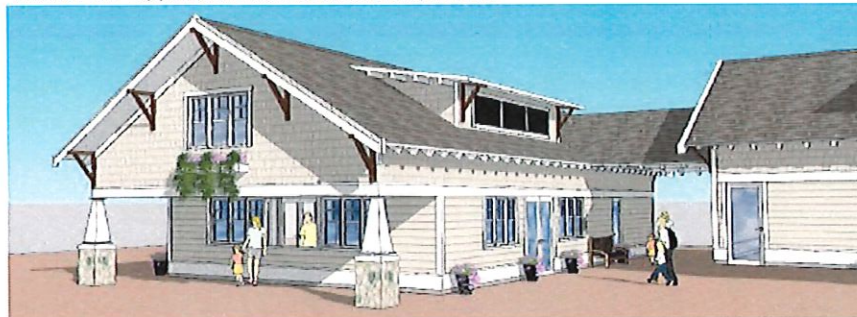
Southwest View - Below