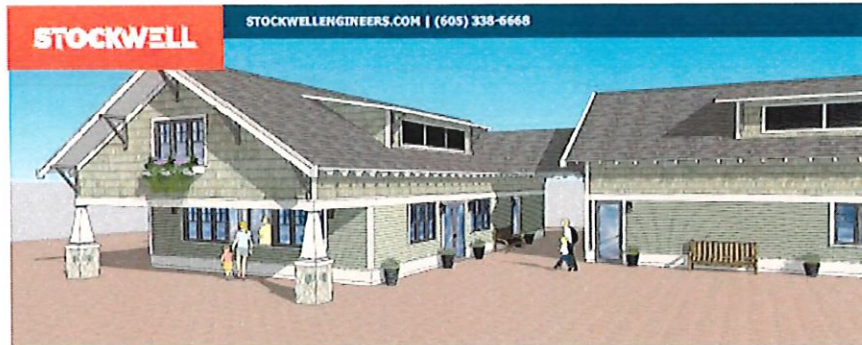
Northwest View - Top (with exterior color and material finishes) and Below